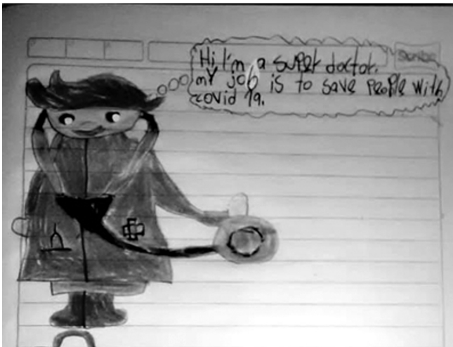
Figure 1. A Learner Presents a Medical Doctor as a Superhero Note. “Hi, I’m super doctor, my job is to save people with covid 19” (Class artifact 19/05/2020)

The analysis of different class artifacts allowed me to confirm that the redesign of available visual and linguistic representations served the purpose of transforming the meanings conveyed in those representations. In several cases, the available designs that were presented in class were transformed in order to express facts about the learners’ realities. For example, one learner created a more human superhero that could help save lives during the Covid-19 pandemic (see Figure 1 below).