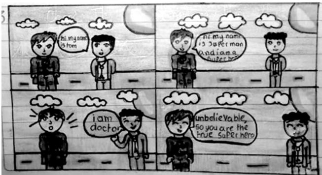
Figure 3. A Learners' Complex Reflection Using Visual Modality

In other cases, these transformations took place in order to present more complex reflections using Spanish or English. One learner created a short comic story in which she compared Superman with a doctor, and presented doctors as superheroes explicitly with words (see Figure 3 below).